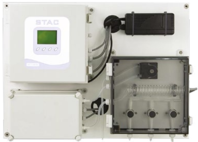
Example of Atrazin detection